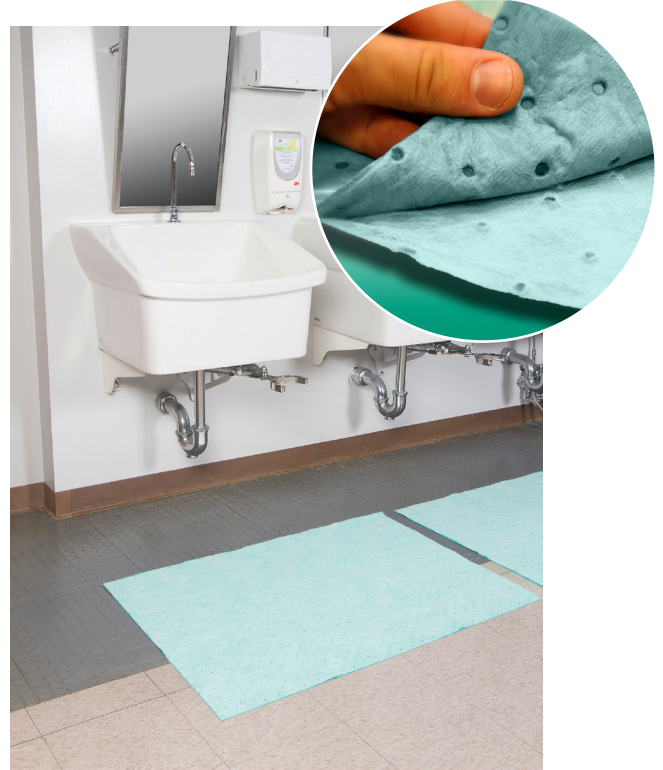
Green = Medium absorbency mats

Mats WITH fluid barrier backing are designed for use on DRY FLOORS. Mats WITHOUT backing absorb from both top and bottom surfaces and may be used on wet floors.