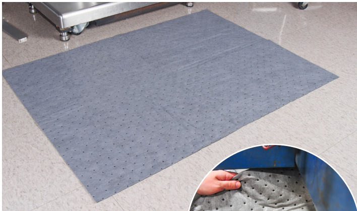
Gray = Low absorbency mats